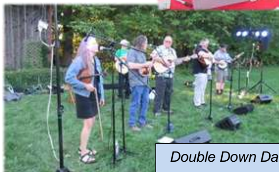
Double Down Daredevils