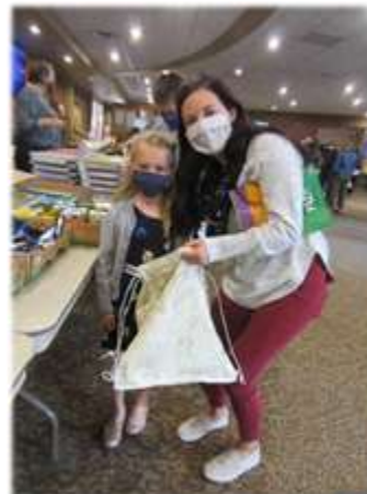
Parents and a child would sometimes share in the task