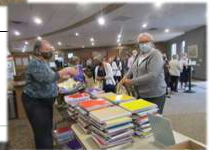
Members would repeat going through the line of goods until all 141 bags were stuffed